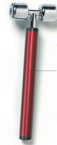
mini double roller neck, cheeks