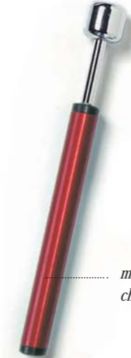
mini roller cheeks, eyes, forehead