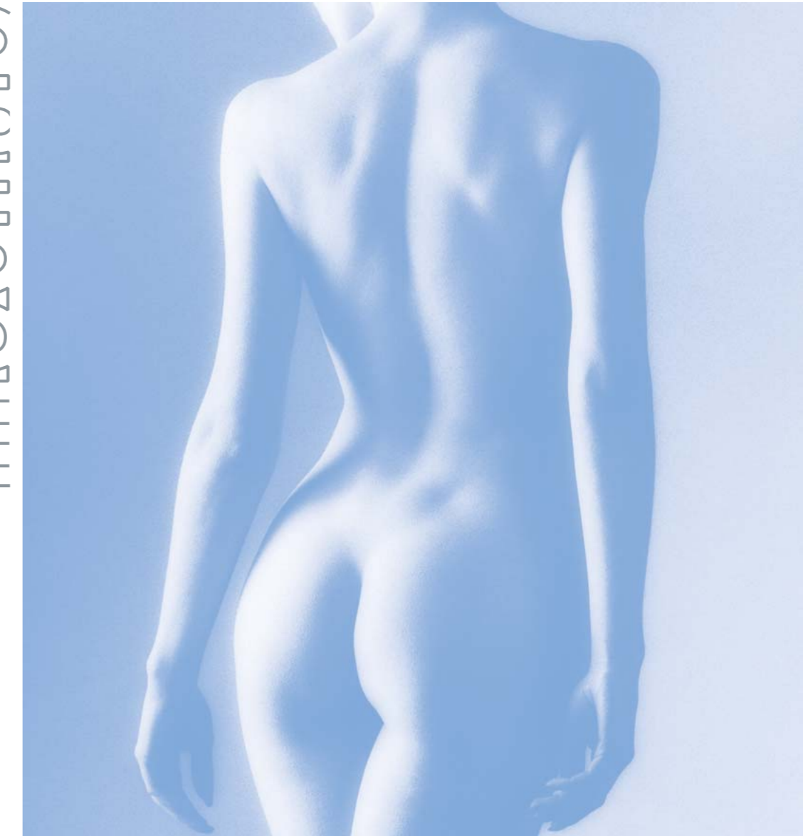
Visible and lasting therapeutic success for your aesthetic institute