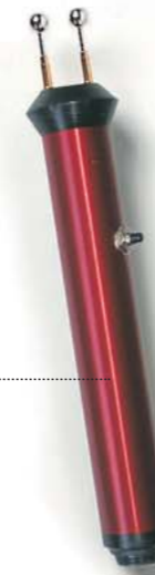
twin probe eyes