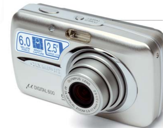
digital camera for documentation of therapy progress

cal industry to give you unmatched reliability. Finally, medilab offers you a long-lasting partnership to safeguard an excellent return on your investment. Key to your future business success is a profitability far above average to ensure quick amortization. Based on conservative data of existing beautytek installations we can derive your anticipated business result in a personalized spread sheet. Installation and in-service is supported by thorough on-site training. From application seminars to advertising layout samples we will always be at your service.