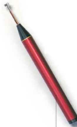
Y probe neck, cheeks, breast